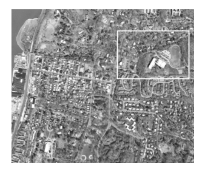
Irvington 1940 (top) and Irvington 1995 (bottom); the school site is enclosed in the white rectangle.